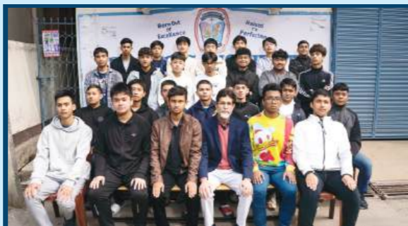
ICSE 2024 BATCH

Our understanding of the students' needs at different stages of their preparation, has been the guiding force behind the structure and methodology of each subject.