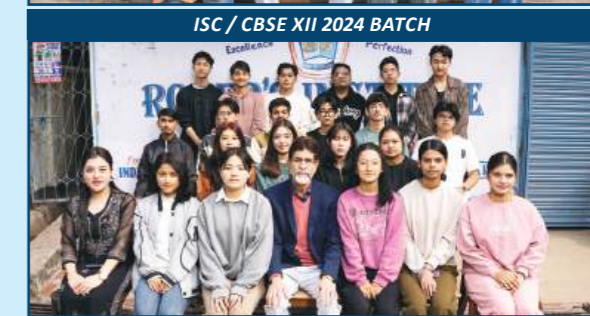
ISC / CBSE XII 2024 BATCH