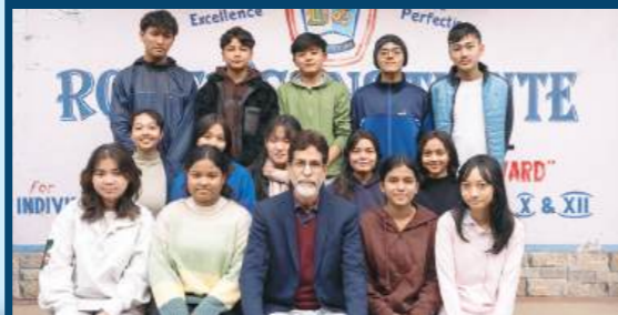
CBSE X 2024 BATCH