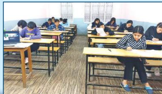
STUDENTS APPEARING FOR MOCK TEST

To maintain our tradition of always providing the best to our students, we can assure you that with our dedication, perfect guidance and sincere efforts, we can no doubt help you to realise your cherished dream.